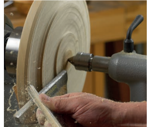
103890 Coronet Falcon Traditional Live Centre, 2 Morse Taper

This live centre features two high quality sealed-for-life bearings, giving incredibly smooth rotation and the 60° point is optimised to give the best grip possible from a single point of contact. It is ideal for use on spindle work and can also be used to support headstock-mounted bowls and larger vessels from the tailstock.