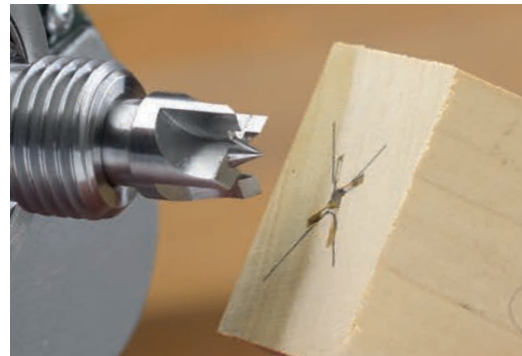
Fig 9.2 Coronet Hawk 16 mm 4-Prong Drive Centre shown.