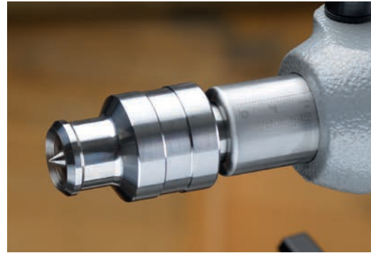
Fig 9.1 Coronet Falcon Ring Centre shown.

Place the knockout bar into the hole positioned at the opposite side of the headstock from the drive centre and give the centre a sharp knock to dislodge it.