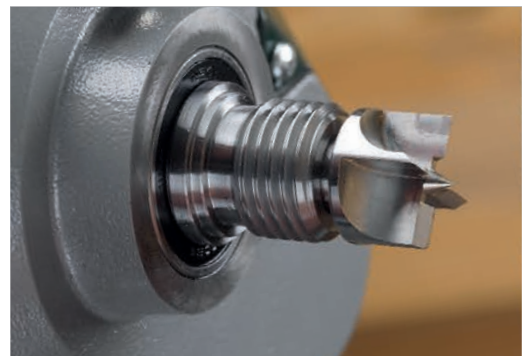
Fig 9.3 Coronet Hawk 22 mm 4-Prong Drive Centre shown.