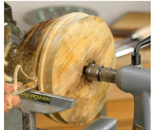
103900 Coronet Falcon Ring Centre, 2 Morse Taper

This ring centre features two high quality sealed-for-life bearings, giving extremely smooth rotation. The ring design gives a larger area of contact than a traditional live centre for an increased grip. This makes it ideal for supporting small or brittle timbers and works very well with paper-jointed blanks, giving a strong grip to both pieces of timber either side of the joint.