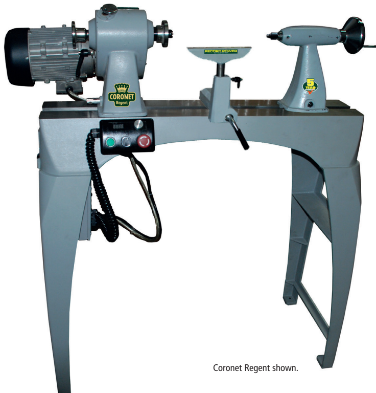
Coronet Regent shown.

Coronet Regent 18" Heavy-Duty Swivel-Head Cast Iron Variable Speed Lathe